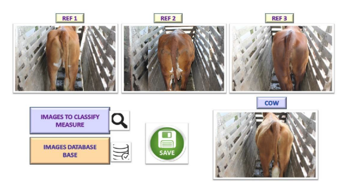
Figure 3. Screen picture of the first step of BCS qualification in cond_corp software

Figure 3 shows the general look of the cond_corp software interface. The three options offered to the user can be seen, the image of the cow to be classified and the basic interface buttons.